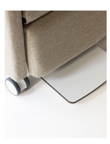
Slide out foot tray keeping the users feet off the ground whilst being moved