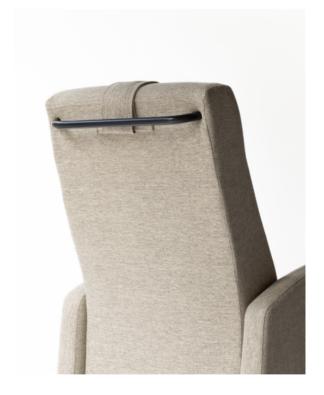
Sleek metal push handle with generous clearance to suit a wide range of carers