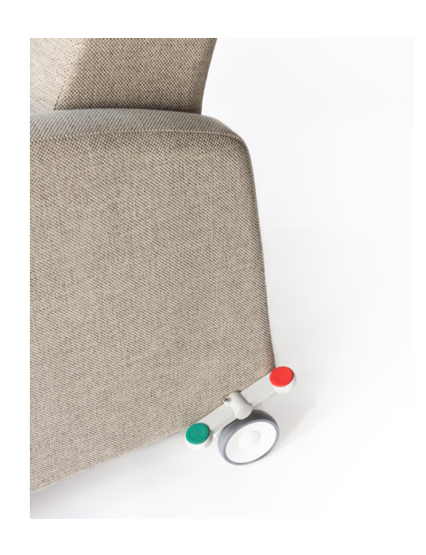
Central locking back castors for ease of use & directional locking front castors for ease of maneuverability