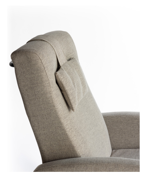
Adjustable head rest with baffled 100% NZ wool inner which provides temperature regulating properties