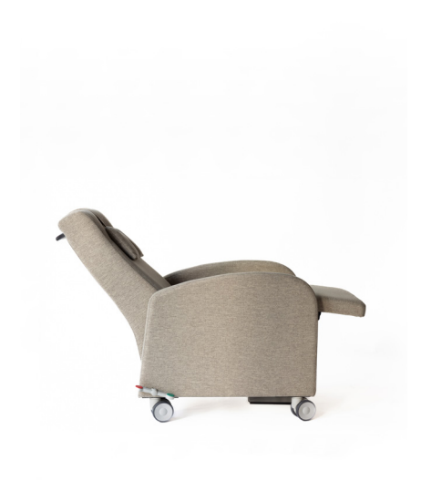
Tilt in space 'Zero gravity' recline position with seat and back relationship consistent