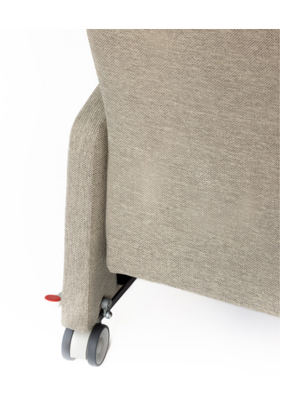
Premium twin wheel German castors for ease of manoeuvring